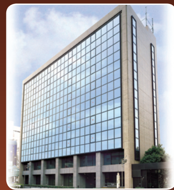
Worldwide Headquarters Tokyo, Japan