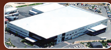
Sukagawa Factory - Fukushima, Japan