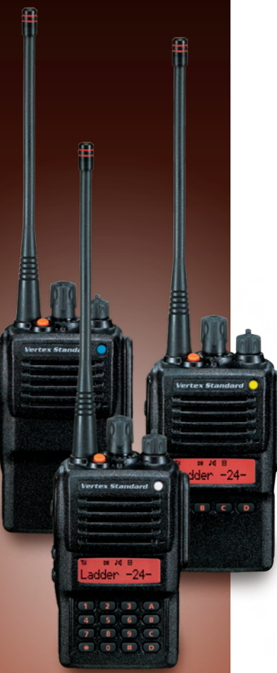
VX-P820 Series Smallest submersible P25 radios

Get quality radios for maximum cost performance.