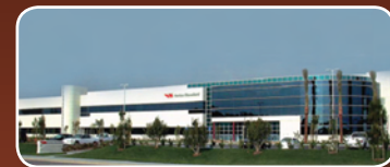
U.S. Headquarters - Cypress, CA