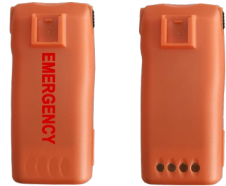
Battery Emergency / Rechargeable